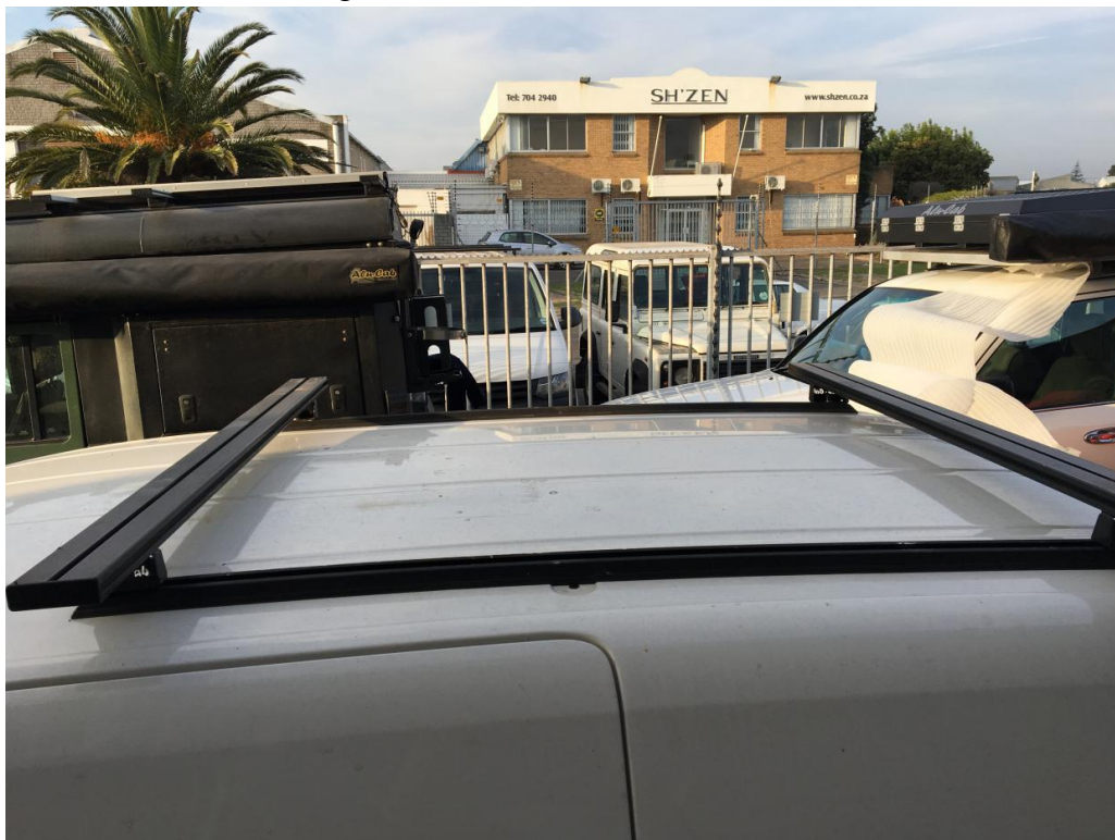
Figure 10: Double Load Bars Installed on Vehicle