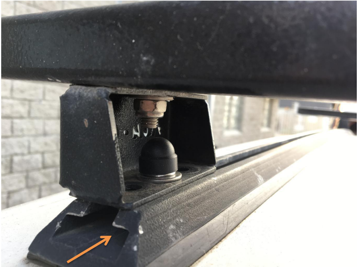
Figure 1: Roof Rail Tract which the Square Nut is inserted into