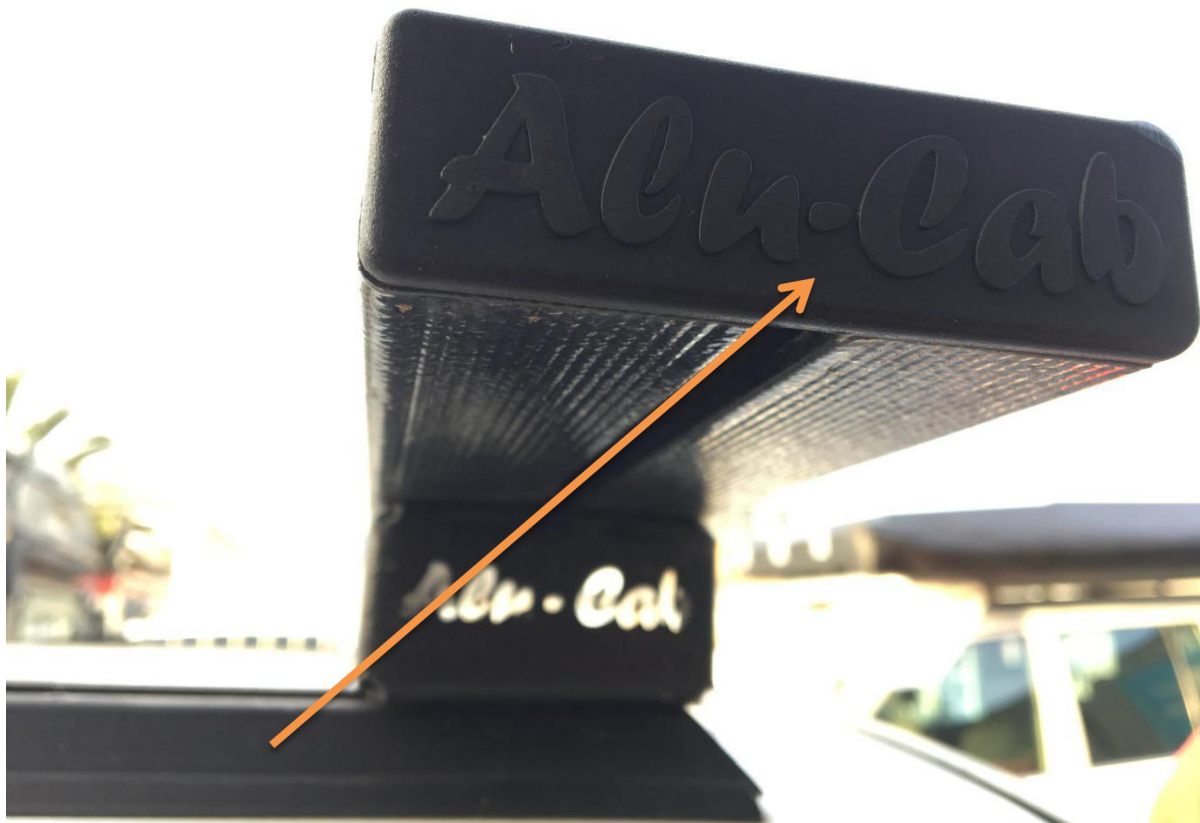
Figure 3: Load Bar End Cap

We now need to mount our Load Bars to the Mounting Brackets. Our first step here is to remove the Load Bar End Caps. We can then insert an M8 Hex Bolt into the Nut Slot of the Load Bar. We can now position and place the Load Bar and Hex Nut over our Mounting Bracket and fasten it down using a Flat Washer and Nyloc Nut. Once fastened, you can fit the End Caps Back onto the Load Bar. The following Images will demonstrate this process: