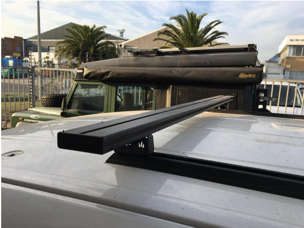
Figure 9: Front Load Bar Installed