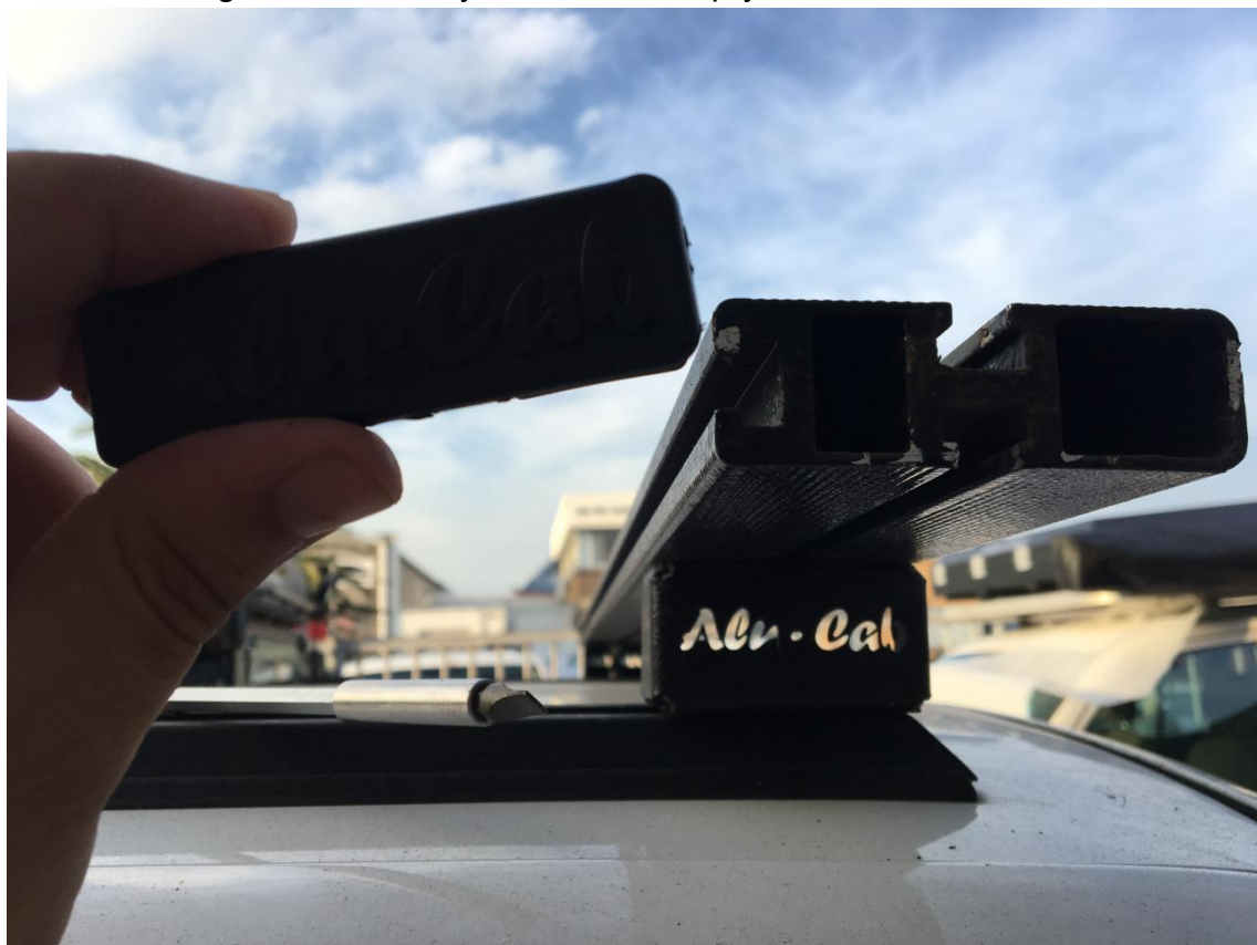
Figure 5: Remove the End Cap once loose