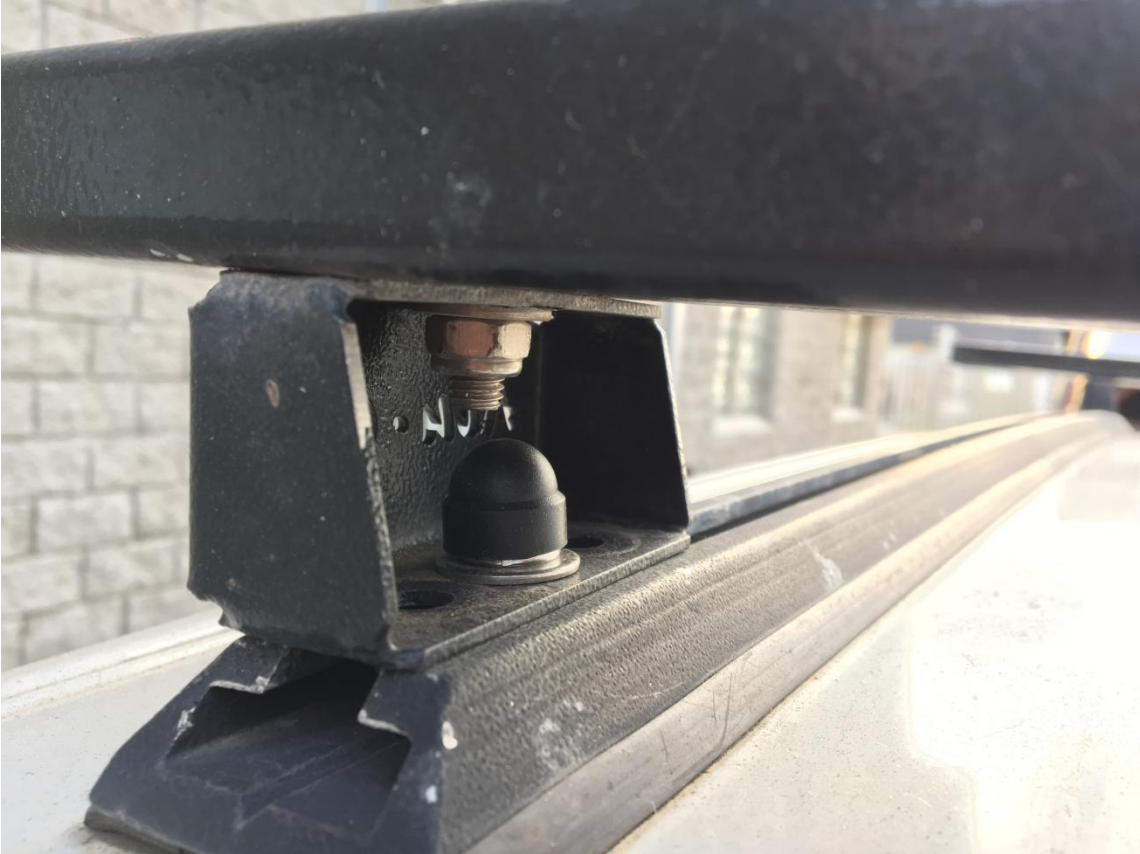
Figure 7: Fastened Load Bar to Mounting Bracket