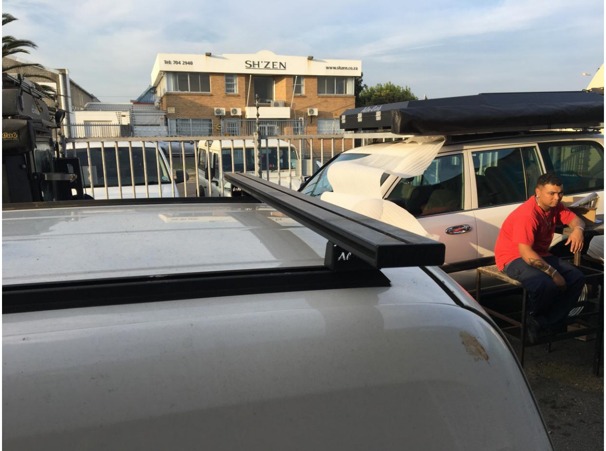
Figure 8: Rear Load Bar Installed

Depending on how many Load Bars you are using for your application and vehicle, repeat the Fitment steps for the other Load Bars you are installing.