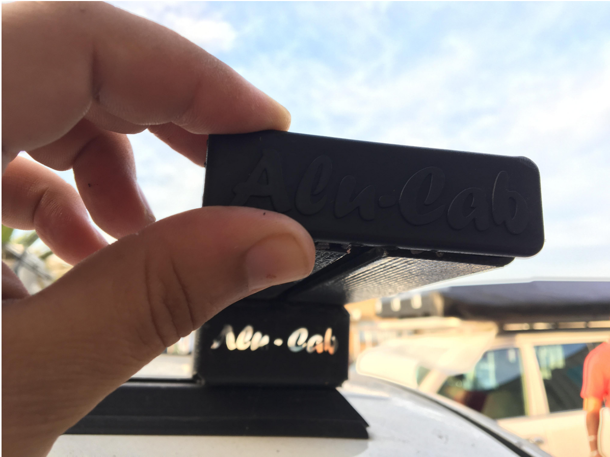
Figure 4: You may need a tool to pry it off of the Load Bar